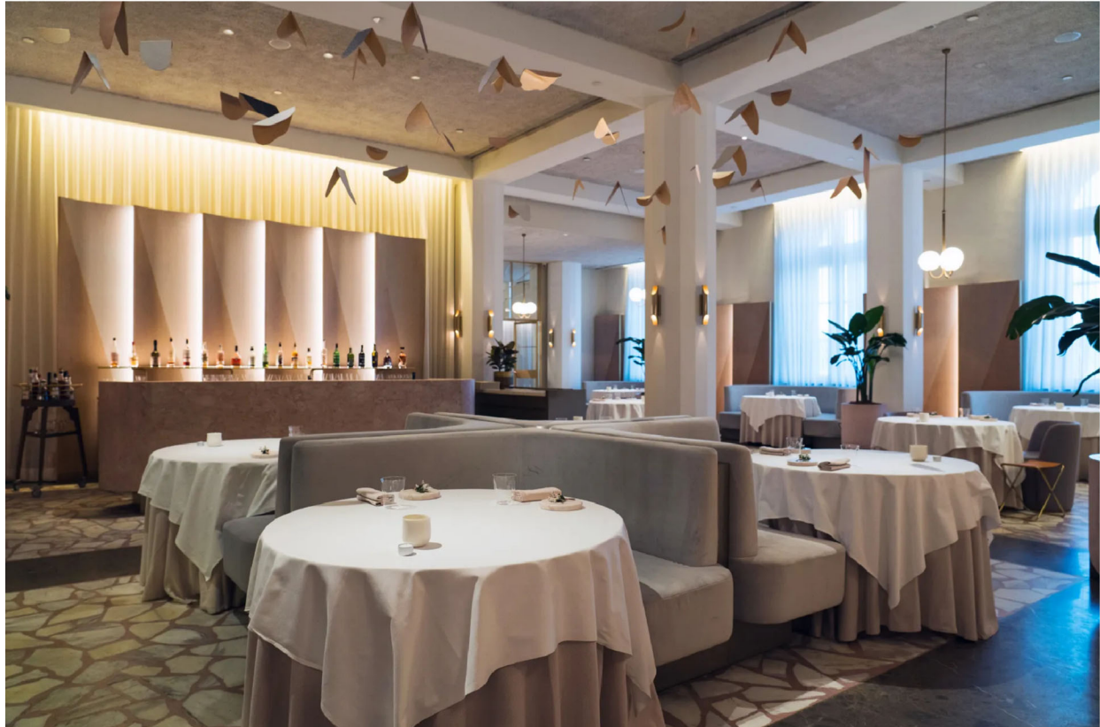
The three-star restaurant Odette.